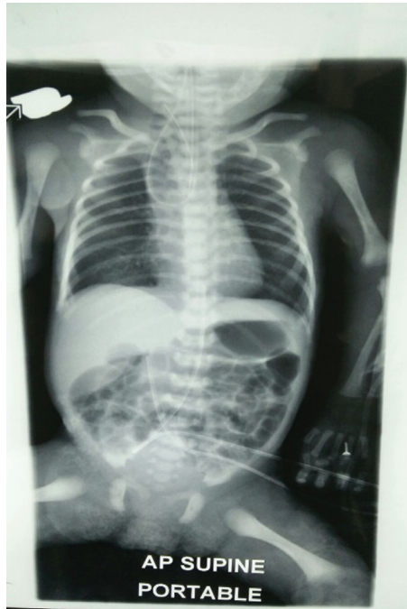
A chest and abdominal radiograph of the child with coiled Ryle's tube seen.

tachypnea and grunting. During admission, there was persistent drooling of saliva with a gurgling sound. On examination, the baby was pink but tachypneic, on nasal prong oxygen 0.5 l/min, with mild subcostal recession. No other abnormalities were detected except for hypospadias. However, during Ryle's tube insertion, the tube coiled up into the nose. Chest radiographs revealed coiled tube at upper part of the esophagus with relatively increased gas bubbles seen in stomach and bowels. In addition, bedside echocardiogram and ultrasound of the urinary system perform showed normal structures (Fig. 2).