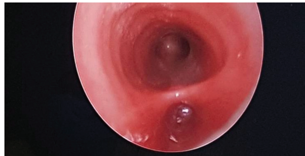
Intraoperative finding (fistula seen).