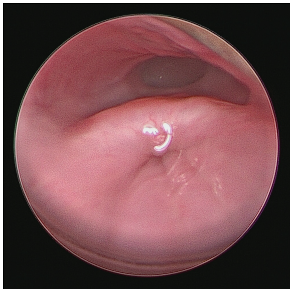
Endoscopic image during telescopic examination. Fistula seen at 2.5 cm from the carina.

intermittent fever with productive cough along with poor weight gain. Subsequent barium swallow at 6 months after operation show persistent TOF after repair and persistent middle esophagus narrowing.