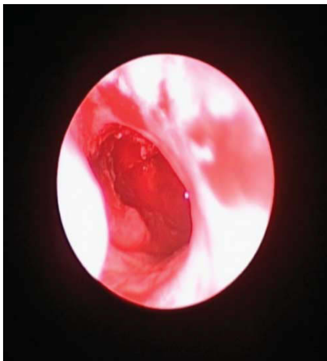
The right side after removal of the remaining adenoid tissue.

remaining adenoid tissue. Subjective and objective evaluations after removing the remaining tissue were carried out, and comparisons were made with conventional adenoidectomy patients to study the efficacy of this technique.