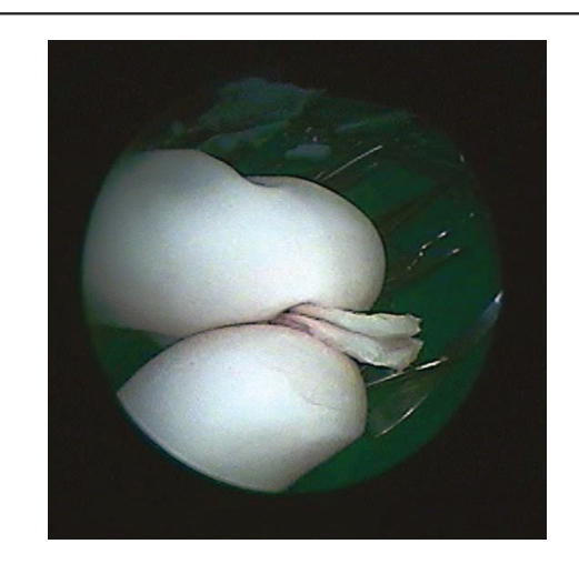
The grooved tragal cartilage graft with its perichondrial layers.