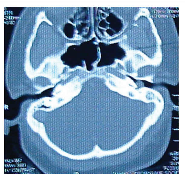
Axial computed tomography (CT) of the temporal bone.