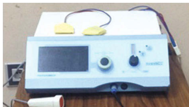
The VocaSTIM unit.