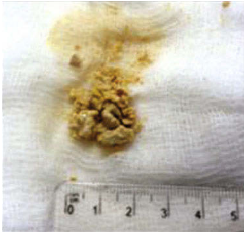
Gross picture of the stone after removal.