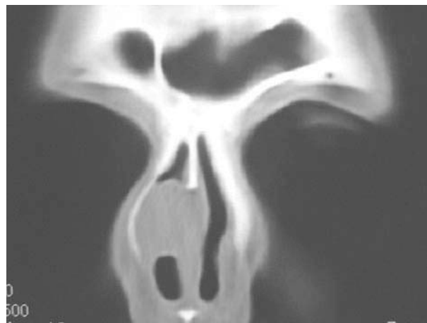
Preoperative computed tomographic scan (coronal view) shows a rounded mass in contact with the nasal septum and expanding the overlying nasal bone.