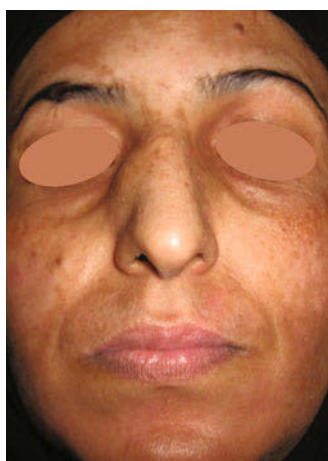
Dorsal nasal deformity of the right lateral wall of the nasal pyramid.