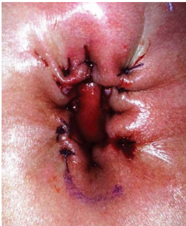
The star-shaped stoma.