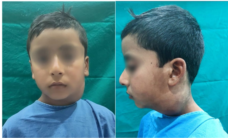
Fig. 1 Frontal and lateral view of submandibular swelling

lymphadenopathy was noted clinically in other sites of head and neck region.