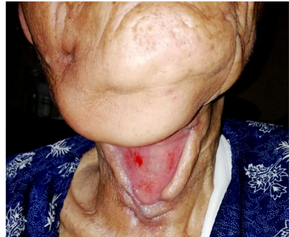
Fig. 2 Cervical skin loss after adequate incision, drainage, and debridement of Ludwig's angina

Similarly, in the adult group, septicemia was developed in 9 cases (15%) followed by airway obstruction in 6 cases (10%), empyema, pneumonia, and cervical skin loss in 4 cases (6.6%) each (Table 4) (Fig. 2).