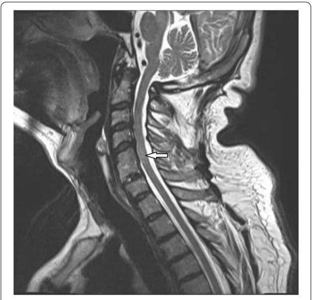
Fig. 3 Postoperative second year control, T2-weighted, sagittal section of vertebra MRI: the arrow shows the myelopathic signal changes of the spinal cord

Trauma from foreign bodies or surgical instruments is the major cause of RPA, and nontraumatic RPA is very rare in adults. This is because of the regression of