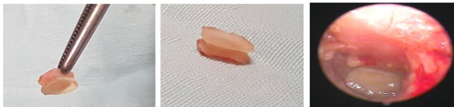
Fig. 1 Preparation and positioning of inlay butterfly tragal cartilage