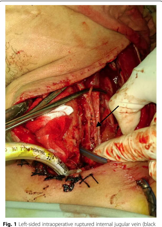
Fig. 1 Left-sided intraoperative ruptured internal jugular vein (black arrow) in the first patient

urgent neck exploration, ligation of the IJV, and wound dehiscence. After that, he had repeated wound dressing with a successful cure of infection.