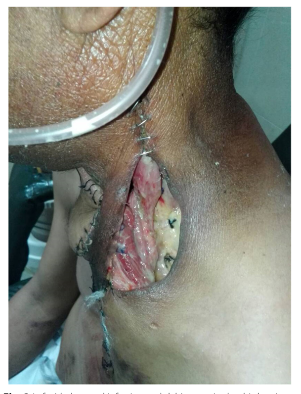
Fig. 2 Left-sided wound infection and dehiscence in the third patient

Our study showed that ten patients developed IJV blowout after having neck surgery for oncologic resection with some sort of neck dissection. Although selective surgical techniques for addressing the cervical lymph nodes during the procedure of neck dissection has led to more preservation of vital structures, those preserved structures have become liable to postoperative morbidity and complications. Primary radiotherapy and salivary fistulae remained as major contributing factors to catastrophic vascular insults. Breaching the outer adventitial layer of the vessel has always been a culprit in the pathogenesis of vessel rupture [5]. In the present study, five patients had PCF before the IJV blowout while another three acquired it while managing the bleeding. Three patients were given primary radiotherapy. One did not develop PCF, the other developed it before IJV rupture and the last one acquired the fistula as a traumatic complication during urgent neck exploration to control IJV bleeding. Owing to the paucity of this condition, statistical significance could not be determined for specific